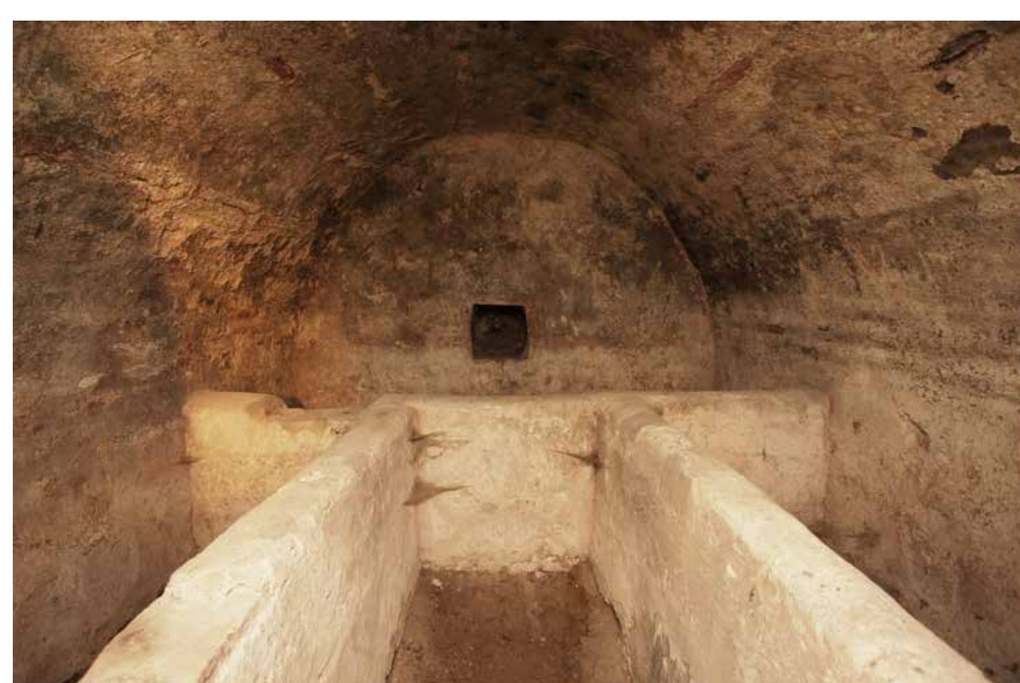
1. Naissus , vaulted tomb with figural representations, view from the east.