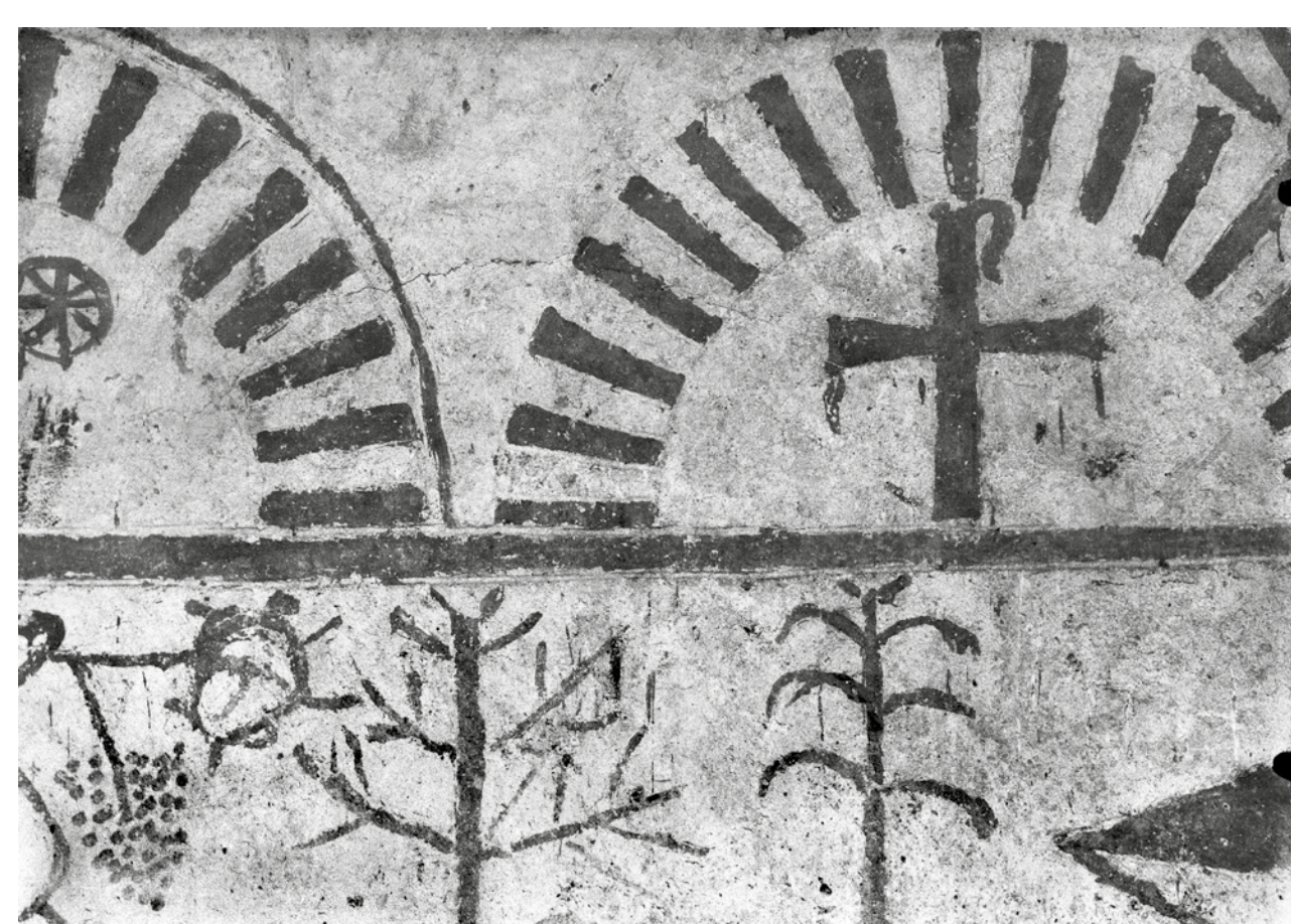
6. Tomb discovered in 1933, detail of the wall painting (photo documentation of the Institute of Archaeology, Belgrade).

Sojourns of emperors during the 4 th century, important production centres, military factory ( fabrica ) and imperial officinae for objects made of precious metals, the fact that emperors Constantine I (306-337) and Constantius III (421) were born there – Constantine I played an important role in the shaping of the city of his birth – influenced prosperity, monumentalization and intense building activities in Naissus (Niš, Serbia). Although few in number, the frescoes in public and private buildings testify the importance of this kind of decoration in the Constantinian and post-Constantinian city and its surrounding. Archaeological researches established the fact that painted walls could be found in representative buildings within the Late Antique fortified city of Naissus and economic-distributive centre with villas of rich citizens in the vicinity of the city, in the suburbium identified as Mediana .