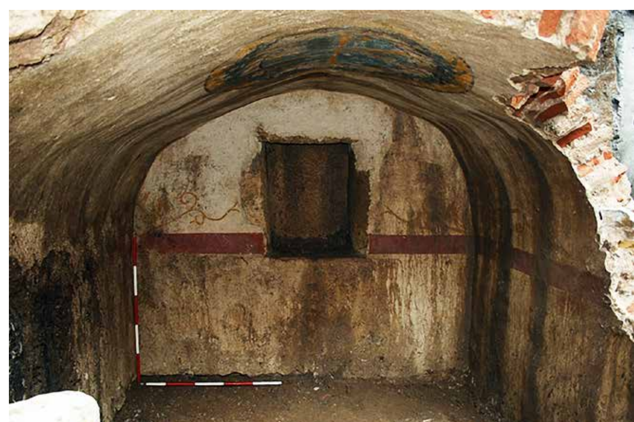
3. Tomb in the Ratka Pavlovića Street, view from the east (photo Z. Radosavljević).