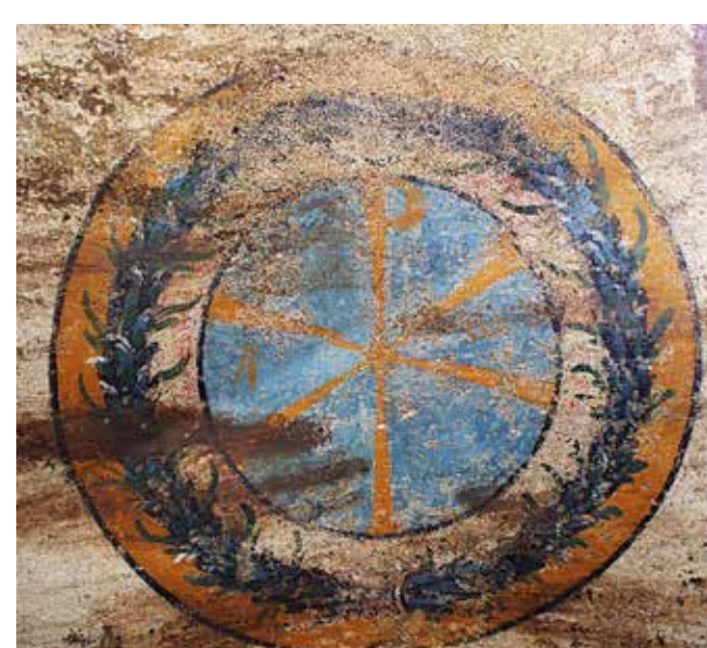
4. Tomb in the Ratka Pavlovića Street, Christogram on the ceiling.